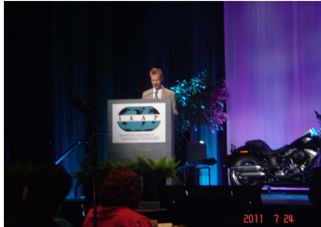
EFAM Convention July 2011

"It's never too late to become the person you always wanted to be."